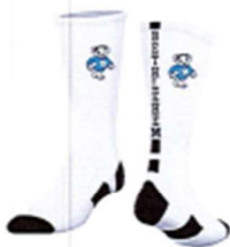
#1 WHITE (ELITE STYLE)