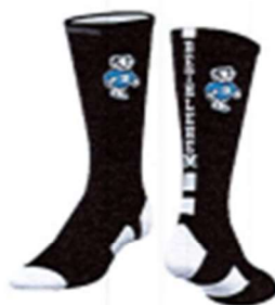
#2 BLACK (ELITE STYLE)